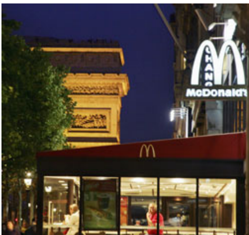
McDonald's in Paris with the Arc de Triomphe

On a bright, mild Sunday afternoon in March 2007, at a convention center in Paris, the annual Salon International de l'Agriculture was winding down. The Salon was a week-long trade show that literally brought the farm to the city. Hundreds of farmers and truckloads of farm animals came to Paris to give urbanites a taste of la France Profonde . It was an opportunity for city kids to pet horses, chase chickens, and be flabbergasted by the amount of waste matter that poured out of cows. It was also an occasion to showcase the meats, cheeses, and wines that made the French countryside such a cherished source of sustenance. No less than that, the event was a way for Parisians to express their support of French agriculture—in a sense, to reaffirm their own Frenchness. The patriotic overtones were catnip for politicians: President Jacques Chirac had kicked off the Salon the previous Sunday, and the floor traffic throughout the week included a steady flow of ministers and members of parliament.